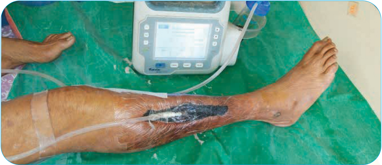
Figure 1- vacuum assisted closure