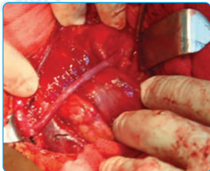
Figure 2: Vascular Bypass