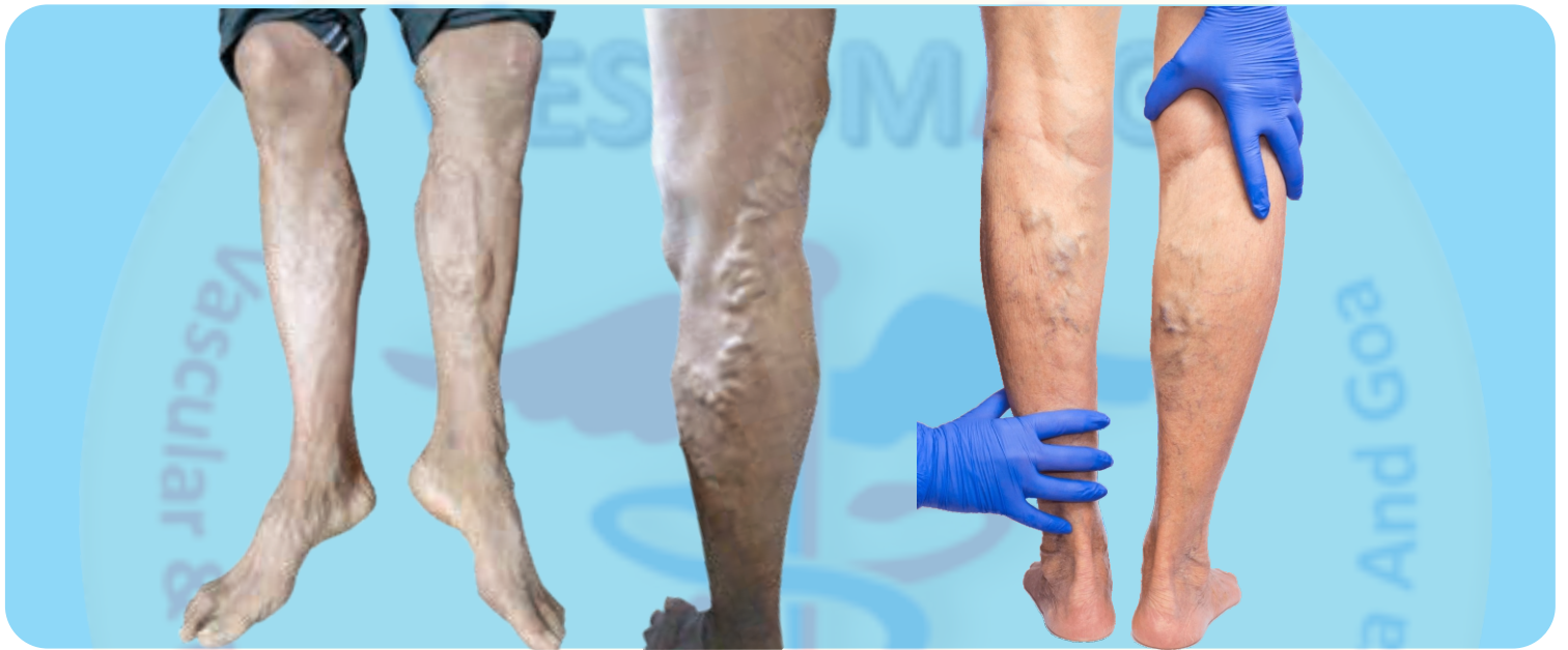
Figure 1 - Varicose veins

Varicose veins are a very common problem, appearing as twisting, bulging, rope-like cords on the legs. They are the result of problems with the valves within the venous system of the leg. All the veins in the leg contain one-way valves that keep blood flowing from the legs up towards the heart. When the valves become faulty, the blood gets accumulated in the vein, making it enlarged and swollen, called varicose veins. The veins become weak and twisted, and the lumps bulge out from just under the surface of the skin. Varicose veins usually occur in the legs but they can also be formed in other parts of the body.