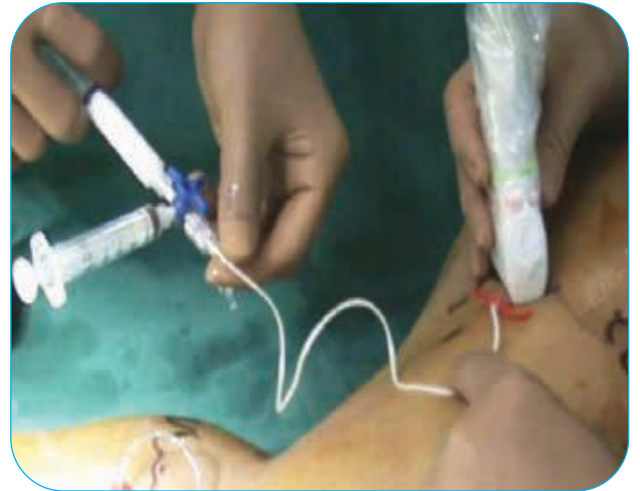
Figure 2 - Foam Sclerotherapy

Endovenous ablation techniques : These minimally invasive procedures have revolutionized the treatment of varicose veins and are currently considered the treatment of choice for a majority of patients. These are non-surgical methods wherein a very small catheter is introduced in the vein under sonography guidance and the vein is fired by laser or radiofrequency energy. The closed vein will eventually be absorbed within the body. Newer advances include radial laser fiber, introduction of mechanical and chemical ablation (MOCA) for non-thermal treatment of varicose veins as well as the use of GLUE.