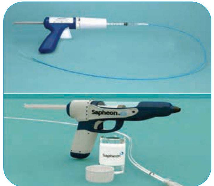
Figure 4 - Glue